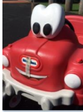
17. In the Nursery