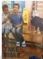
19. EITHER – a visitor postcard OR on the staffroom stairs