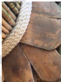
23. The treehouse tunnel