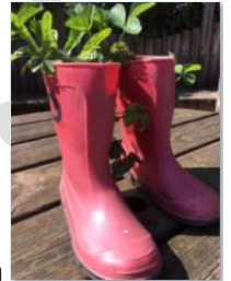
20. Table in skipping area