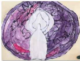
21. Entrance hall art