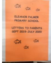
18. By the fish