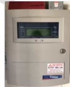
22. Fire alarm control panel – juniors