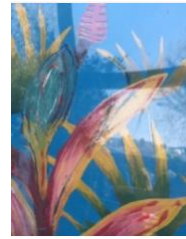
16. On the main tower stairs