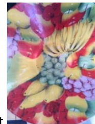
24. A fruit bowl for breaktime fruit